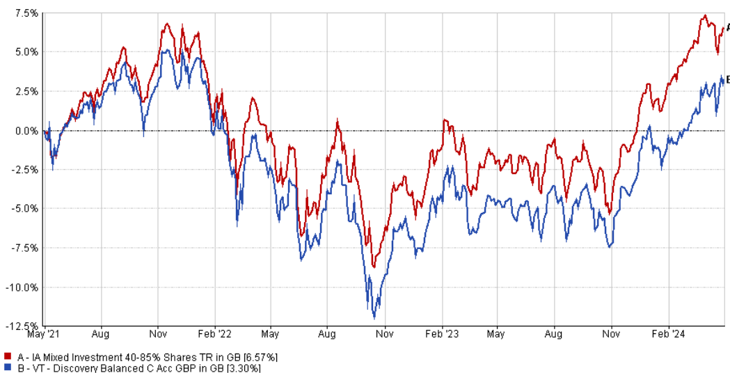
■ A - IA Mixed Investment 40-85% Shares TR in GB [6.57%] ■ B - VT - Discovery Balanced C Acc GBP in GB [3.30%]

30/04/2021 - 30/04/2024 Data from FE fundinfo 2024